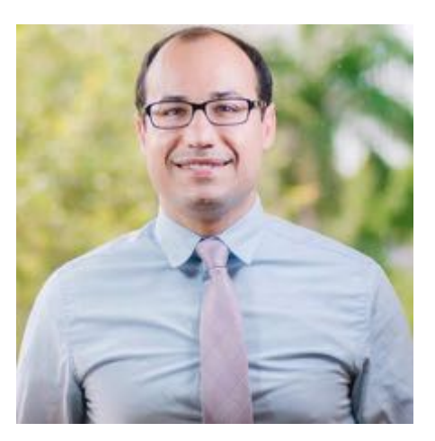
Why I Wish to be NASAP President

After 11 years of active participation in NASAP, I am actively seeking the office of President. My passion is to ensure that Adlerian Psychology and NASAP survive and thrive in these increasingly challenging times, especially with its three critical challenges: creating